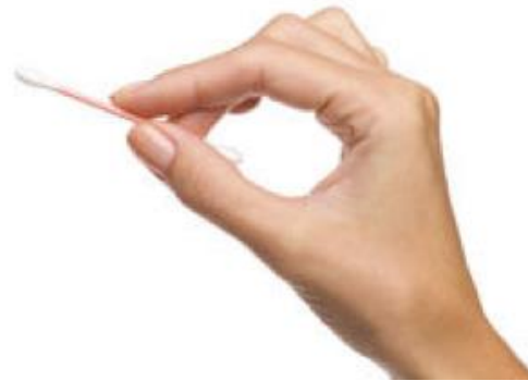
Self collected Vaginal Secretions