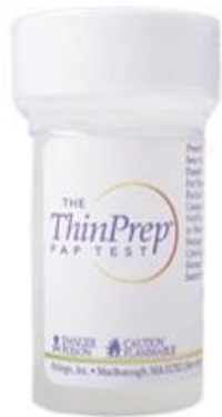
Cervical brush in ThinPrep™