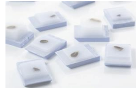
Paraffin-Embedded Formalin-Fixed Samples